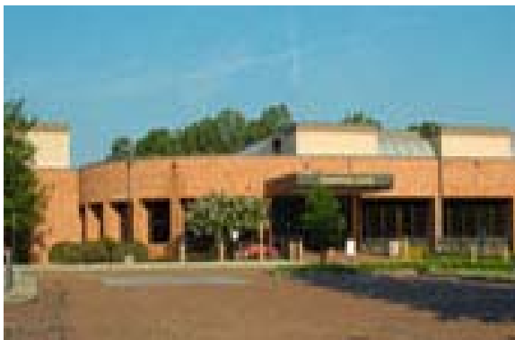
Great Hall at Germantown